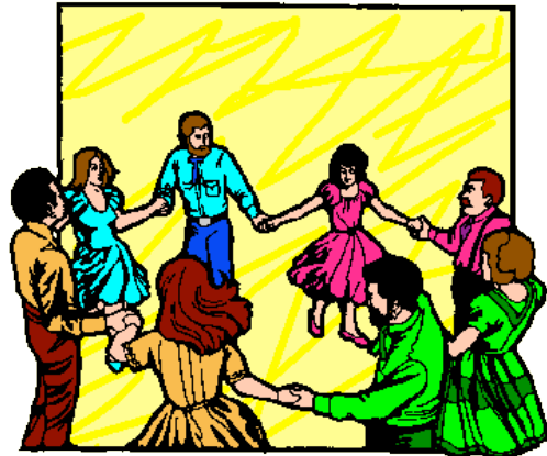
Square Dancing "Eight Hands 'Round"