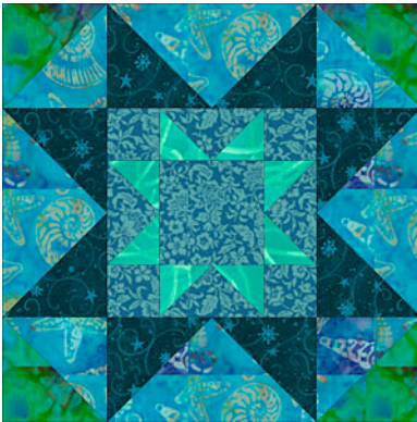
Eight Hands Around Quilt

Integrating Quilting, Music, and Square Dancing with Social Studies, Language Arts, Math, and other subject areas